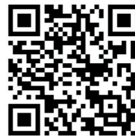
2025 Liv2bekind Marathon